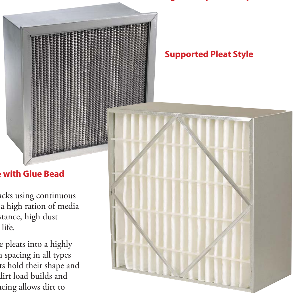
If you are using other styles of rigid cell extended surface filters, compare performance and price to SERVA-CELL 2VS filters

The glue bead separators bond the pleats into a highly rigid pack that maintains uniform spacing in all types of operating conditions. The pleats hold their shape and do not deform or collapse as the dirt load builds and resistance rises. Uniform pleat spacing allows dirt to load evenly over every square inch of filter surface area. The media is fully utilized with no blocking off.