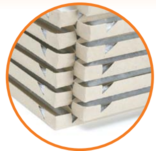
Notched Frame Design