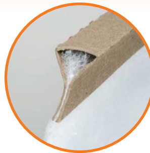
Pinch Frame Design