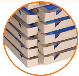
Pinch Frame Design