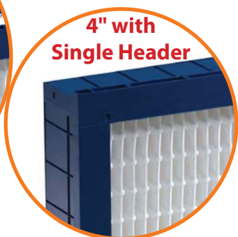
4" with Single Header