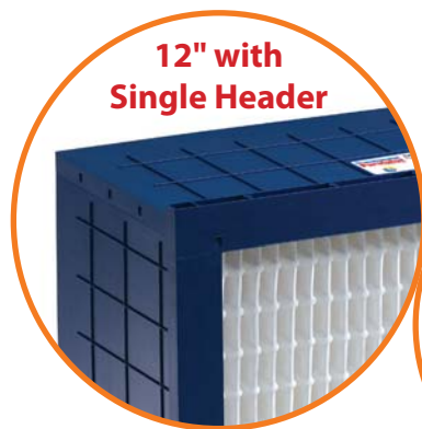
12" with Single Header

4" offered in MERV 11 & 14 and 12" offered in MERV 11 & 15