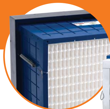
Spring latches are used to secure the 12" Reverse Flow DOMINATOR filter to the holding frame.

The cell sides are made of high strength, high impact polystyrene plastic. They are moisture, chemical and corrosion resistant. DOMINATOR filters contain no metal components – no rust, no corrosion. The elimination of metal also makes these filters completely incinerable and light weight.