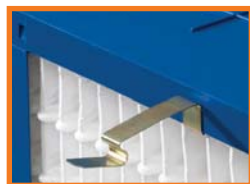
2" & 4" pre-filter clips hold the pre-filter to the Reverse Flow DOMINATOR filter.