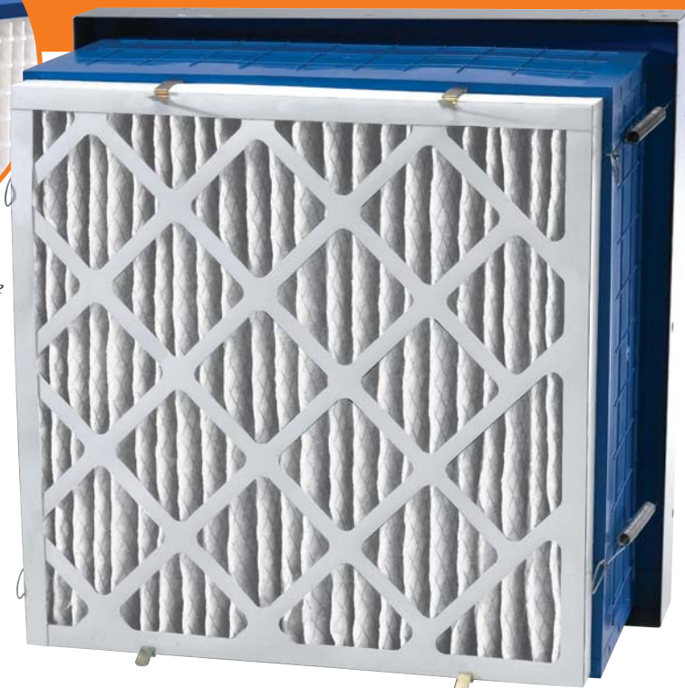
Various sized metal frames are available to make the DOMINATOR suitable for most any application.